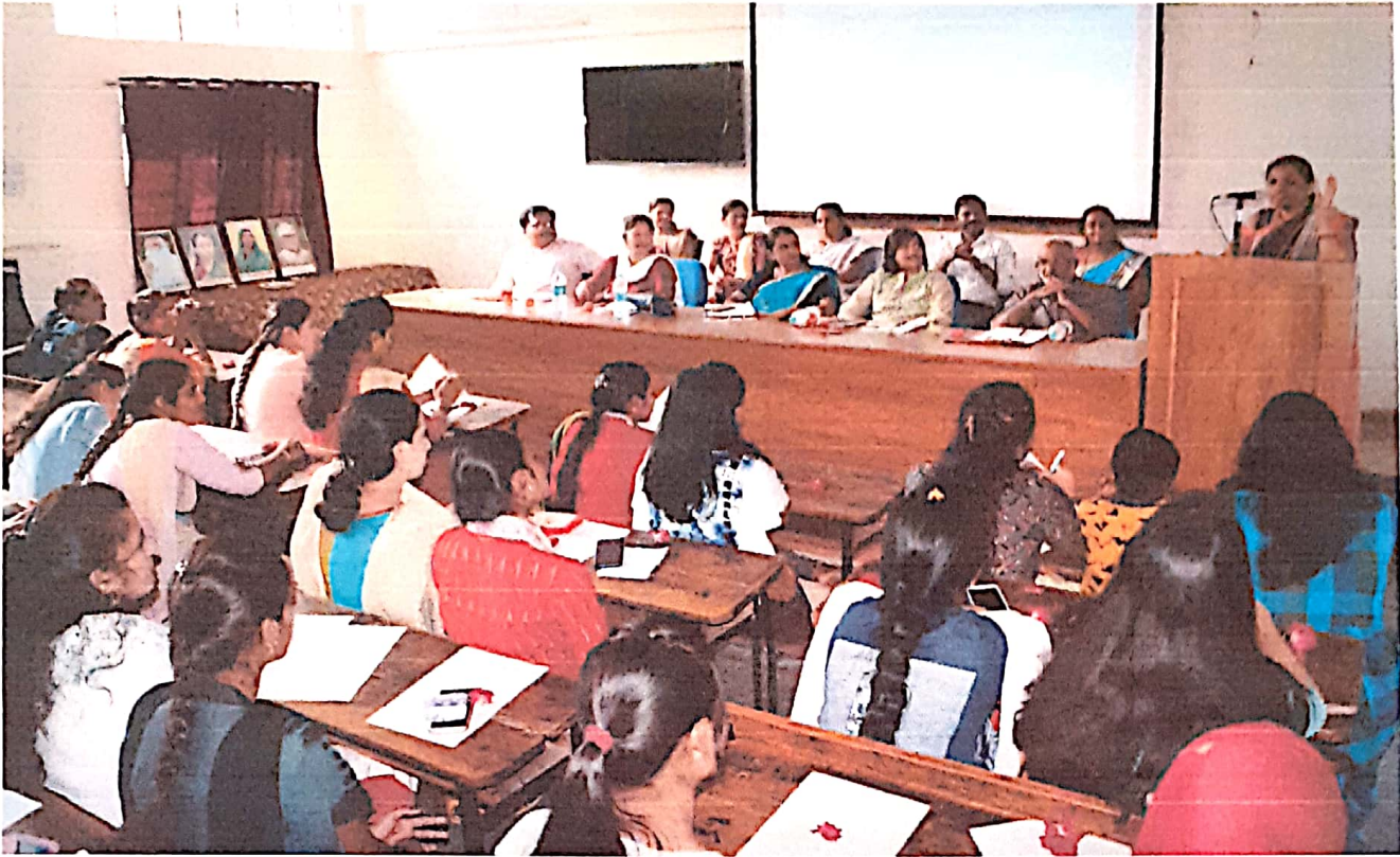
Alumnae of the college expressing their feelings about college and giving vote of thanks.