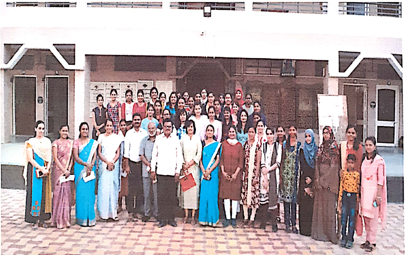
Group photo with Alumnae, President, Vice president and Committee members